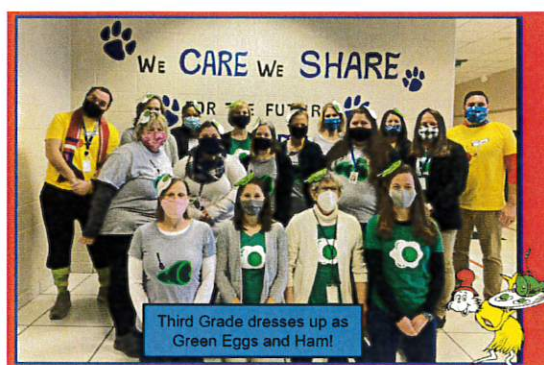
Third Grade dresses up as Green Eggs and Ham!