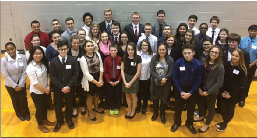
Thirty-nine students from the East High School, West High School, and East Junior High School competed in the Regional PA Junior Academy of Science earning 24 First Awards, 14 Second Awards, and one Third Award. We also had four students earn Excellence Awards, four receive Perseverance Awards, and three earned perfect scores. First Award winners will join over 3,000 students from all over the state to compete at the PJAS State Meeting held at The Pennsylvania State University on May 14-16.