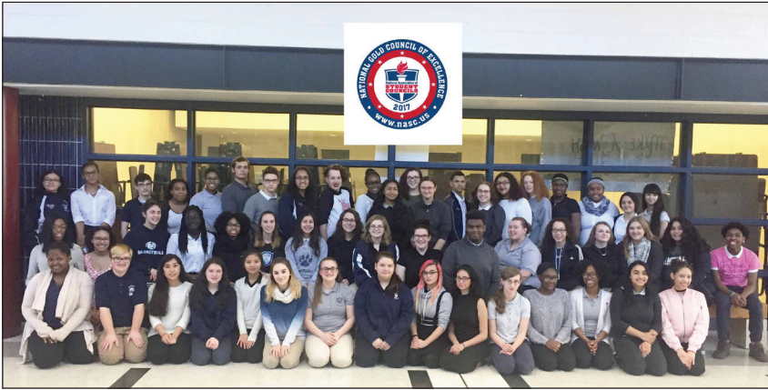
The West High School Student Council earned the 2017 National Association of Student Councils National Gold Council of Excellence seal for leadership and excellence as a student council.