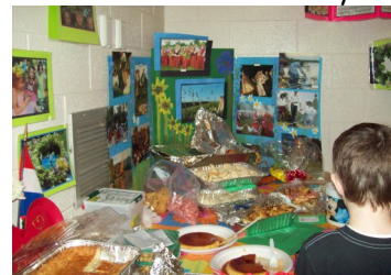
CREC Multicultural Day

SEC: see page 6 for Multicultural Day article